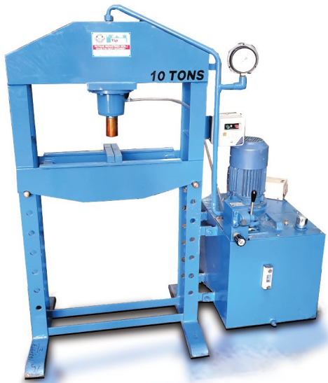
10 TON CAPACITY