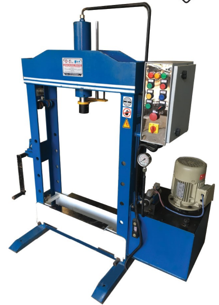
LIGHT DUTY MODEL

SIMPLE OPERATION: Press is provided with motorized pump unit and hand operated control valve, Pump is driven by flange coupled motor and has a pressure adjusting valve for adjustment of high pressure.