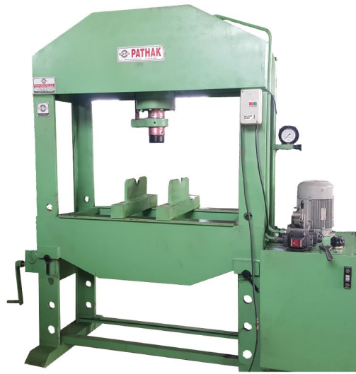
100 TON CAPACITY