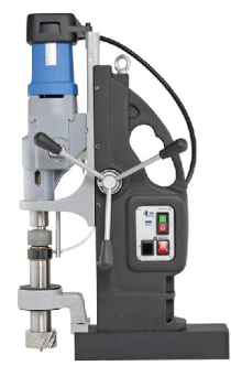
MAB 1300 Ø 130 mm Core Drilling & M42 Tapping