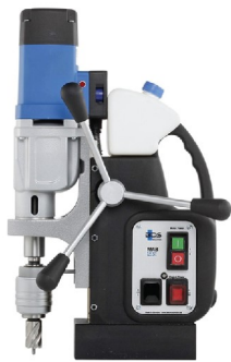
MAB 485 Ø 40 mm Core Drilling & M16 Tapping