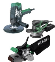
Polishing / Sanding Tools