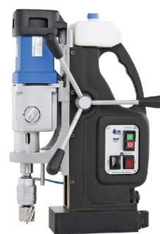
MAB 825 Ø 100 mm Core Drilling & M30 Tapping