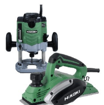
Planing / Routing Tools

MODELS FOR REFERENCE ONLY , TO KNOW MORE ABOUT THE ABOVE PRODUCTS PLEASE CALL US OR VISIT OUR SHOWROOM