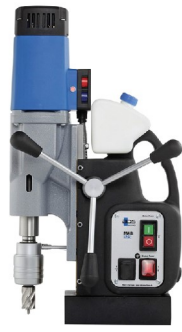
MAB 525 Ø 50 mm Core Drilling & M20 Tapping