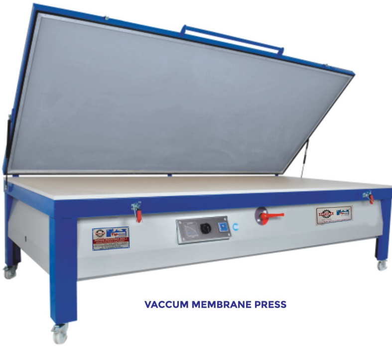
VACCUM MEMBRANE PRESS