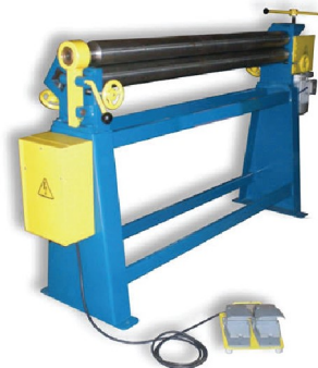
Slip Roll Bending Machine