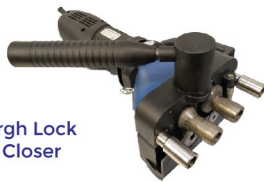
Pittsburgh Lock Seam Closer

This machine goes hand in hand with Lock Forming Machines. Two models are available with maximum closing capacity of 1.2mm sheet thickness. Have provision for speed adjustment & closes tighter & high quality leakproof joints.