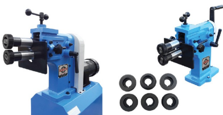
Motorised Beading Machine