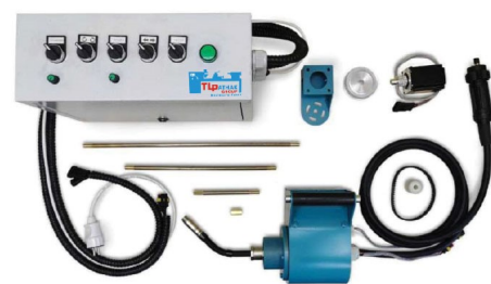
PORTABLE LINE WELDING KIT AND SURFACING KIT (Optional)