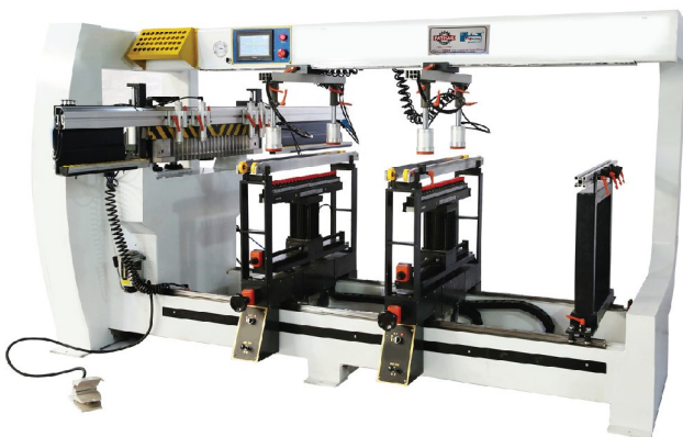
MULTI SPINDLE DRILLING / BORING