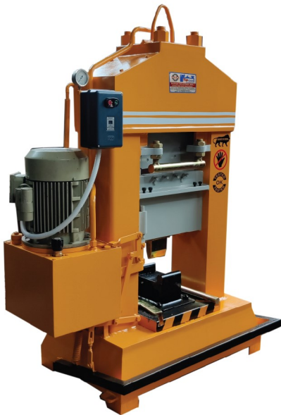
LEAF SPRING BENDING AND CUTTING MACHINE