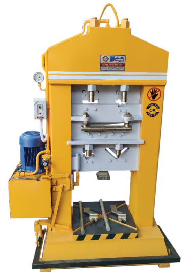
MULTI CUTTER WITH Z ANGLE CUTTING OPTION