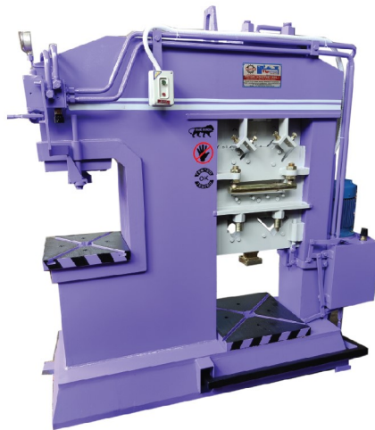
DOUBLE STATION MULTI CUTTER MACHINE