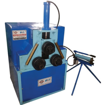
Economical Series Machine