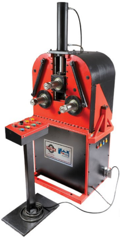
Horizontal and Vertical Positioning Options