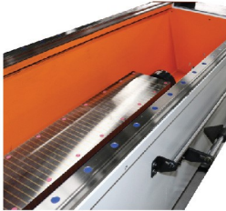
Electromagnetic Table Type