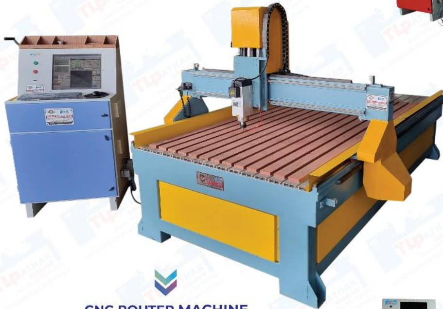
CNC ROUTER MACHINE