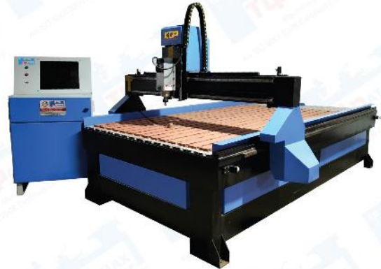
TLP SINGLE HEAD ROUTER MACHINE