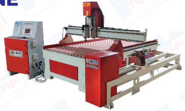
TLP ADVANCE ROUTER WITH ROTARY