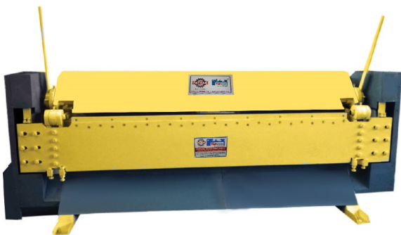
Auto Sheet Folding machine