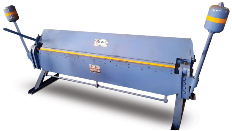
Manual Sheet Folding machine