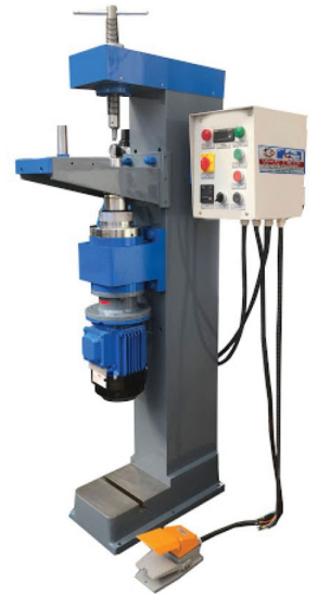
Clutch Plate Riveting Machine