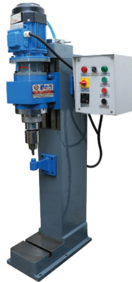
Utensil Riveting Machine