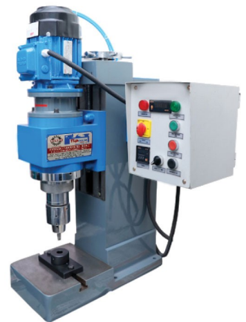
Orbital / Spin Riveting Machine