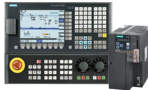
CNC VERSION ALSO AVAILABLE