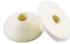
Nylon Sleeve Center