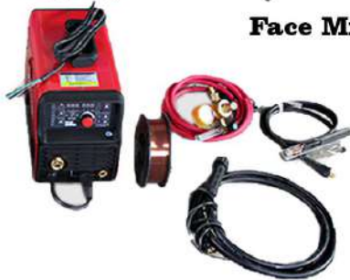
Dioxide Welding Machine Working Component Set