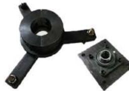
Front and Rear Fixed Seat