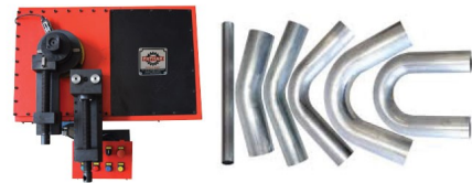
Motor Based Degree Pipe Bending Machines