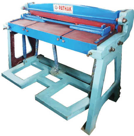
▶ Hand Lever Shearing Machine