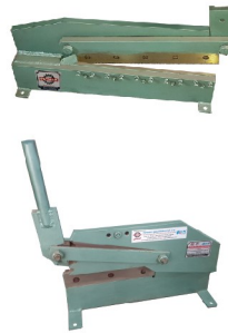
AVAILABLE IN 10", 12", 14", 16"