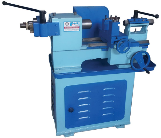
Manual Production Lathe / ADDA Lathe

THE TL PATHAK make Automats, tube parting automats are extremely versatile machines that gives big returns on small investment. Jobs can be profitable handled on these automats with accuracy and precision. These automats have proved economical for mass production of ball bearings and other components. The simple design of these automats, greatly reduces the time of change over of tooling setup from one components to another.