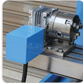
The 4th axis