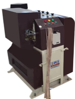
KITE STICK MAKING MACHINE