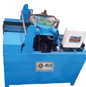
TOOTH PIC MAKING MACHINE