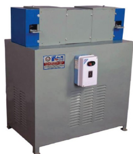
BAMBOO KULFI STICK MAKING MACHINE